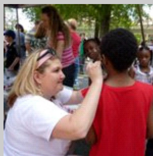
Children get face paintings at a Farmville (Va.) UMC festival.