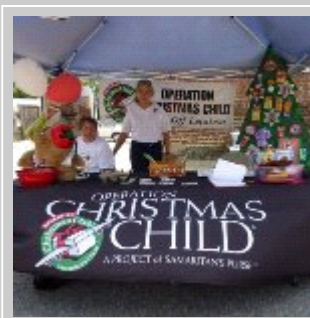
Farmville members support several missions, including Operation Christmas Child.