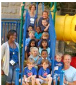
Children in the Atlanta community attend vacation Bible school at St. Mark UMC.

congregation built their current facility in 1903 in what is now the heart of Atlanta. Averaging about 425 Sunday worshipers in two services, St. Mark was once the “premiere pulpit” in Atlanta in the mid-40s. The church was the voice of racial inclusion in the segregated South in the 50s and 60s and is believed to be the first “white” Methodist Church to receive an African-American member in Atlanta. Through the turbulent 60s and 70s, the congregation did their best to reach out to a decaying neighborhood.