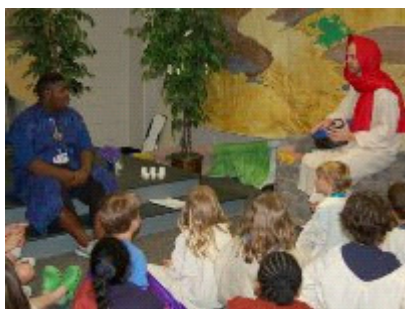
Members act a scene from the Bible for vacation Bible school at St. Mark UMC.

St. Mark has had numerous female associate pastors and female lay leaders.