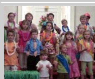
Children sing at the spring musical at Farmville UMC.