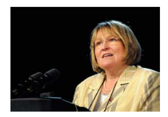
Bishop Rosemarie Wenner of Germany tells dozens of demonstrators for full inclusion of gays and lesbians that the denomination's bishops feel their pain. Wenner is the new president of the Council of Bishops.