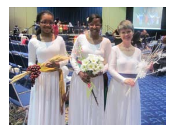
Liturgical dancers from Garrett-Evangelical Theological Seminary lend their gifts to GCSRW's 40th anniversary worship service.