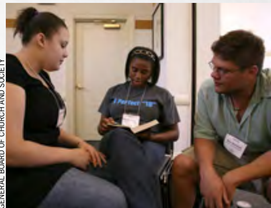
GENERAL BOARD OF CHURCH AND SOCIETY

Another 7 cents supports mission and ministry through districts, annual conferences and jurisdictions. Six cents goes toward Special Sunday offerings, World Service Special Gifts and The Advance.