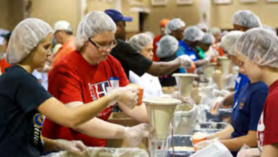
SOUTH CAROLINA CONFERENCE

More than 1,200 volunteers, including 500 youth volunteers, pack 285,000 meals for Stop Hunger Now during the South Carolina Annual Conference in Florence, S.C.