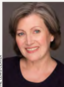
THE LEWIS CENTER

The answer, he said, has been changing over the years. The Mid-Atlantic Foundation has put together a two-year intensive financial academy for pastors. They teach that