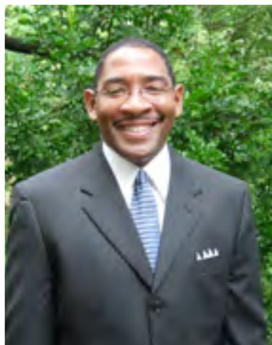
TEXAS METHODIST FOUNDATION