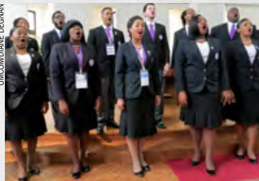
Members of the Wiley College a cappella choir provide music during the International Association of Methodist Schools, Colleges and Universities meeting in Hiroshima, Japan, in 2013. Wiley, located in Marshall, Texas, is one of The United Methodist Church’s historically black colleges.

documents and historical artifacts, this fund ensures trustworthy systems of oversight and financial accountability. It supports the work of GCFA and the General Commission on Archives and History.