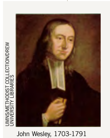
John Wesley, 1703-1791

His outspoken resistance to the slave trade, alcohol traffic, excessive interest charged to the poor and other staples of British economic life in the 18th century expressed his stewardship. The Wesleyan tradition includes giving our voices on behalf of the voiceless, giving our insights and influence to build communities that reflect God's reign of justice, generosity and joy.