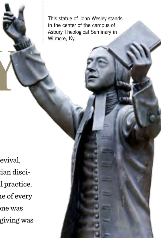
This statue of John Wesley stands in the center of the campus of Asbury Theological Seminary in Wilmore, Ky.