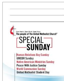
Front of envelope

The Special Sunday envelope is designed to represent ALL six (6) Special Sundays. It is USPS-approved, meaning it can be mailed , allowing members the choice to either mail in their donations or give in person during worship. The image represents the front and back view of the envelope.